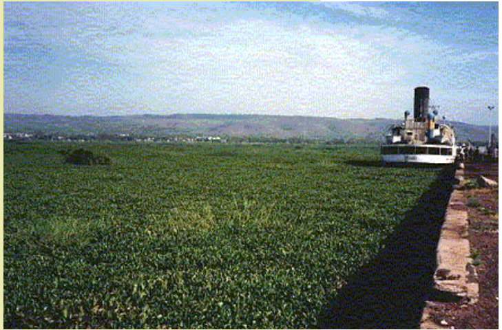
Water hyacinth on Lake Victoria

This South American native is one of the worst aquatic weeds in the world. Its beautiful, large purple and violet flowers make it a popular ornamental plant for ponds. It is now found in more than 50 countries on five continents. Water hyacinth is a very fast growing plant, with populations known to double in as little as 12 days. Infestations of this weed block waterways, limiting boat traffic, swimming and fishing. Water hyacinth also prevents sunlight and oxygen from reaching the water column and submerged plants. Its shading and crowding of native aquatic plants dramatically reduces biological diversity in aquatic ecosystems.